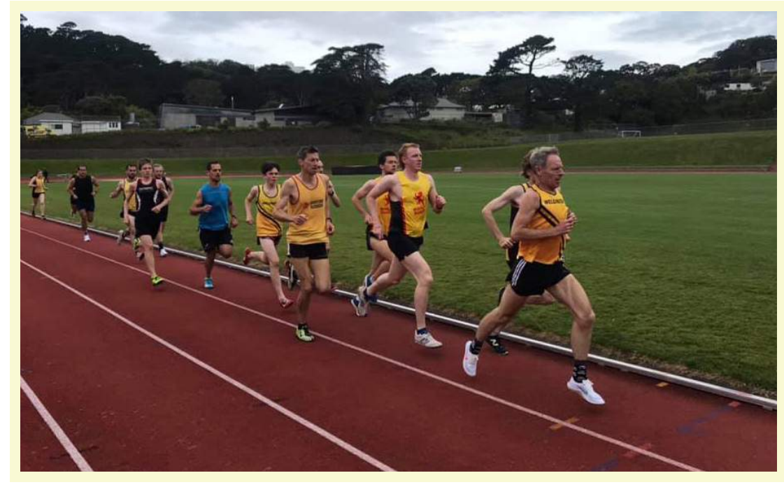
Twilight Event, Newtown