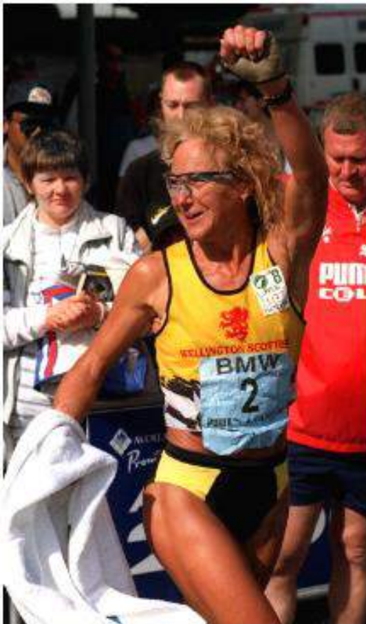
See page 7 for Tribute to Bernie.